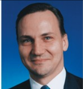
Radek Sikorski Foreign Minister, Republic of Poland