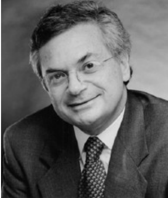
Moises Naim Senior Associate, Carnegie Endowment for International Peace